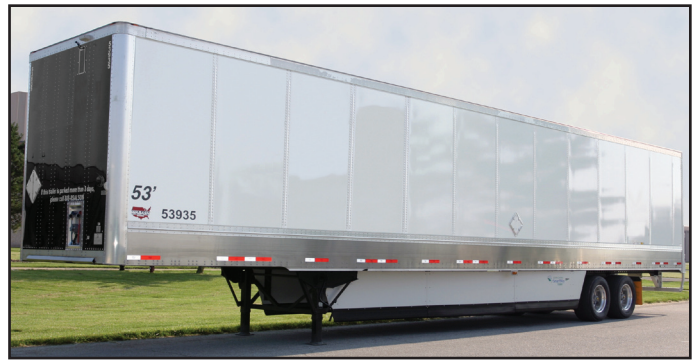
DuraPlate® Trailer Equipped with DuraPlate Aeroskirt™